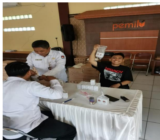
Picture 1. Logistics Management of Pilkada Ink Packing

During the internship, the author was assigned the main task of managing and filing letters. Some of the documents handled include incoming letters, outgoing letters, minutes of events, official travel letters, assignment letters, and accountability letters. The archiving process is done manually by recording the agenda in a book and digitally using a scanner and KPU Purbalingga's internal application. Official travel and duty letters are archived as proof of reporting to the Ministry of Finance through the Sakti application. In addition, the author also plays a role in creating social media content to support the socialization of Pilkada 2024. The content created includes information flyers, Instagram video reels, and holiday greetings that are tailored to social media trends.