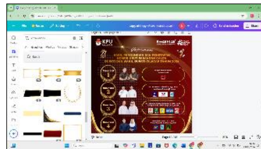
Picture 1. Infographic Flyer Worksheet

The method of activity carried out is direct work practice. The activities carried out by the author during the MBKM internship at the KPU Kabupaten Cilacap include the following: